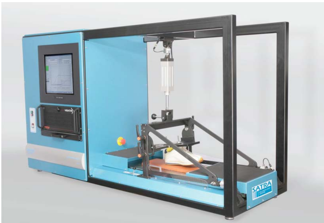
FIG. 3 Example of Test Apparatus

9.2 Prepare and condition footwear, outsole or slider materials according to 10.10.