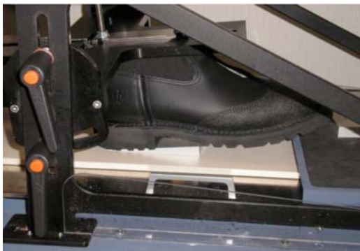
FIG. 1 Example of Footwear Mounted Using 7° Wedge to Set Proper Contact Angle